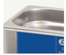
Filling level marking