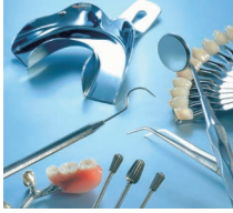
Cleaning in the dental and medical sectors