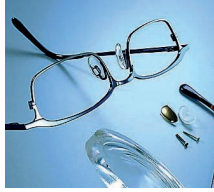
Cleaning of optics and ophthalmology