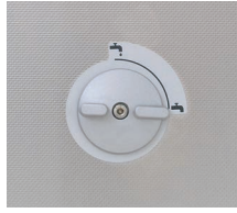
Knob for drain on side

The Elmasonic S units are available in 17 different sizes, ranging from 0.5 up to 90 litres. They are equipped with efficient 37 kHz ultrasonic high-performance transducers of the latest generation.