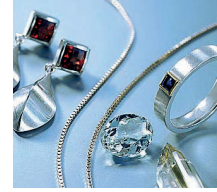
Cleaning in the jewellery branch