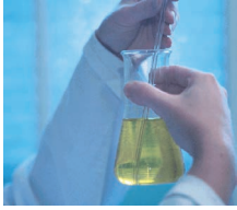
Cleaning, degassing and dispersing in the lab

Ultrasonic cleaning units with specific features for different business sectors