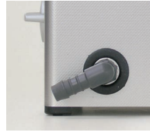
Adjustable drain duct